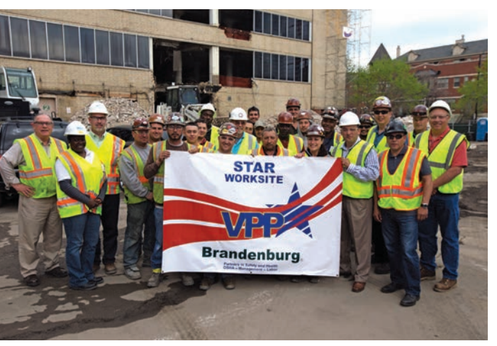
Brandenburg is the first demolition contractor to be certified as a Star Member in OSHA's prestigious Voluntary Protection Program (VPP).